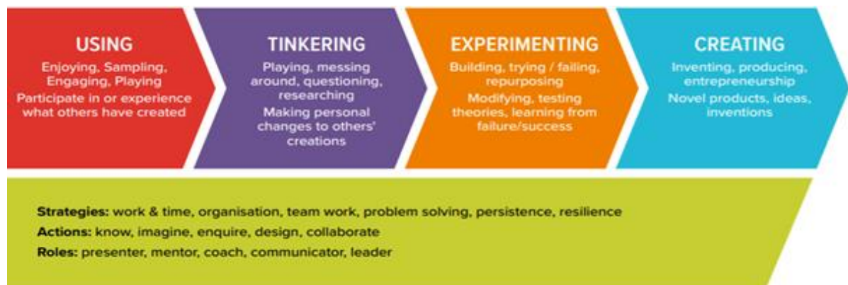
Figure 1. Loertscher et al.'s (2013) uTEC Maker Model

The uTEC Maker Model (Loertscher et al., 2013) visualizes the developmental stages of creativity from individuals and groups as they develop from passively using a system or process to the ultimate phase of creativity and invention. As illustrated in the model below, there are four levels of expertise.