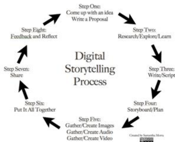
Figure 2. Eight Steps to Create Digital Stories (Samantha Morra, source: 8 Steps To Great Digital Storytelling – Transform Learning ~ written by Samantha Morra )

themselves reading their scripts. The next stage is to put it all together. This is where the magic happens – where students discover if their storyboard needs tweaking and if they have enough “stuff” to create their masterpiece. The final two steps are sharing and reflecting. Sharing online has become deeply embedded in our culture. Knowing that other people might see their work often raises student motivation to make it the best possible work that they can do. Finally, students need to be taught how to reflect on their own work and give feedback to others that is both constructive and valuable. Blogs, wikis discussion boards, and student response systems or polling tools can all be used to help students at this stage.”