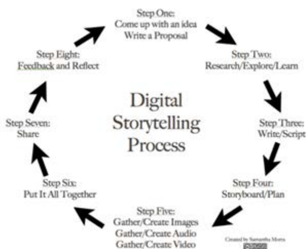
Figure 2. Eight Steps to Create Digital Stories (Samantha Morra, source: 8 Steps To Great Digital Storytelling – Transform Learning ~ written by Samantha Morra )

themselves reading their scripts. The next stage is to put it all together. This is where the magic happens – where students discover if their storyboard needs tweaking and if they have enough “stuff” to create their masterpiece. The final two steps are sharing and reflecting. Sharing online has become deeply embedded in our culture. Knowing that other people might see their work often raises student motivation to make it the best possible work that they can do. Finally, students need to be taught how to reflect on their own work and give feedback to others that is both constructive and valuable. Blogs, wikis discussion boards, and student response systems or polling tools can all be used to help students at this stage.”